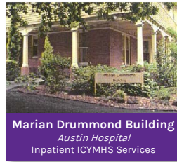
Marian Drummond Building Austin Hospital Inpatient ICMHS Services

Opportunities to work with adolescents and youth are available through community, autism assessment and emergency mental health service rotations. In addition to Stage 2 training, the Austin is able to offer a full Advanced Training Certificate in Child & Adolescent Psychiatry, offered in collaboration with the Mindful Training Centre, Travancore.