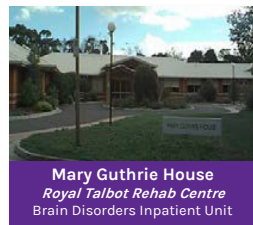
Mary Guthrie House Royal Talbot Rehab Centre Brain Disorders Inpatient Unit

Parent-infant psychiatry is one of the Austin's biggest drawcards, with five registrar posts available at between the Austin, Northpark and Mercy Hospital for Women. Eating disorders experience is available on our inpatient Eating Disorders Unit, as well as the Body Image & Eating Disorders Treatment & Recovery Service (BETRS); a comprehensive community service, with day program and psychotherapy services.