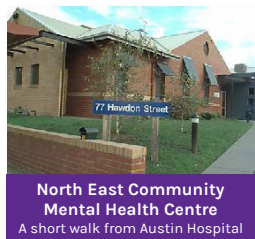
North East Community Mental Health Centre A short walk from Austin Hospital

Austin Health provides services to the North-East Area Mental Health Service, including the Acute Psychiatric Unit, Secure Extended Care Unit, Psychiatric Planning and Assessment Unit (PAPU) and comprehensive community mental health services, including Primary